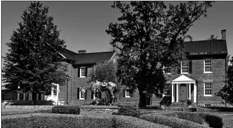
Vine Hill (right side of the photo), was renovated and expanded to become the new Museum.

In September 2009, the National Sporting Library began the creation of a new sporting art museum on its seven acre campus and became the National Sporting Library and Museum. An earlier home of the Library, an 1804 mansion called Vine Hill, was renovated and expanded to house the new Museum. The opening of the new Museum will be celebrated with a weekend of festivities