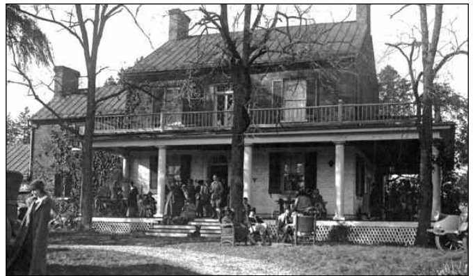
Vine Hill in the late 1920s at the height of early 20th-century sport in Middleburg. The porch was removed by The Chronicle because it was a later addition and not in keeping with a traditional Federal style house.

In 2001, a great-great granddaughter of the Cochran family who lived in Vine Hill during the Civil War, visited the Library. At the time, the building was empty, The Chronicle of the Horse and the Library had moved to new buildings on the campus. We toured